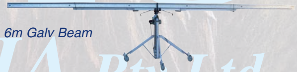
6m Galv Beam