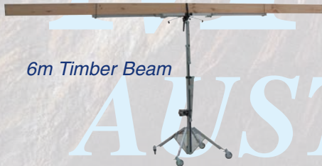
6m Timber Beam