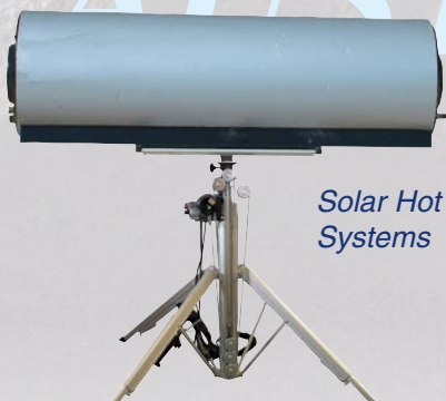
Solar Hot Water Systems

Electrically and manually driven No tools required Carry bags Spirit level in mast Individually extendible legs for uneven surface Operational in confined spaces Castor wheels (additional) Emergency stop Automatic Over load brake switch Strong heat-treated aluminium And much more